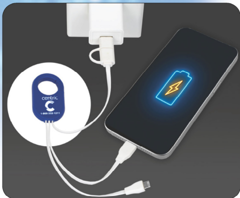
CONVENIENT WAY TO CHARGE YOUR DEVICES