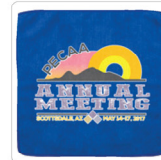
Shown with Optional PhotoImage® Full Color Imprint

Promo 4620C. Prices expire October 31, 2023