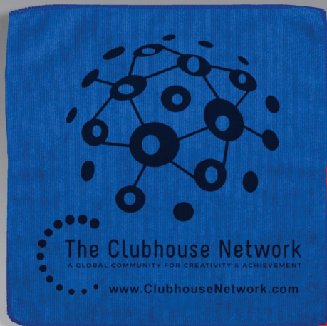
Optional Imprint Area