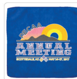
Shown with Optional PhotoImage® Full Color Imprint

Promo 4620C. Prices expire October 31, 2023