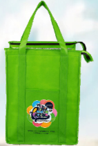
Shown with optional full-colour imprint.