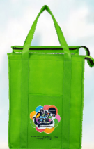
Shown with optional full-colour imprint.