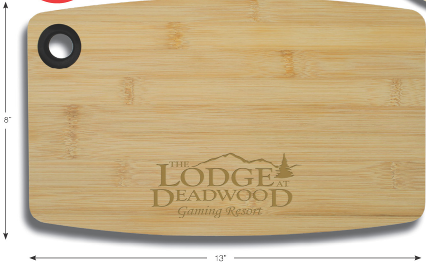
Hanging or Serving Thumb Hole