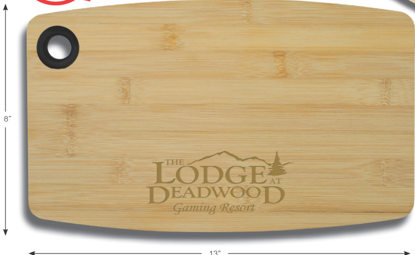
Hanging or Serving Thumb Hole