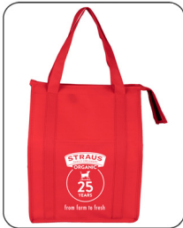
Shown Fully Zipped Up