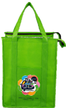
Shown with optional full-colour imprint.